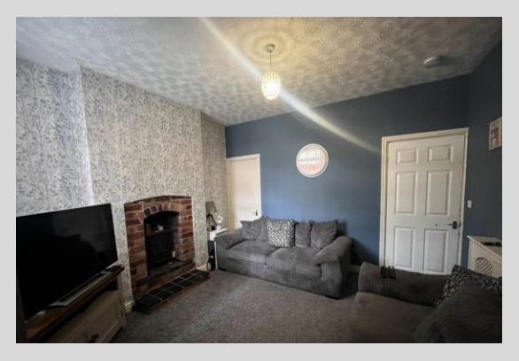
Two bedroom semi-detached house located in Long Eaton, Nottingham,

INVESTORS ONLY. To be sold with tenant in situ, a two double bedroom semi detached house ideally located near the centre of Long Eaton.