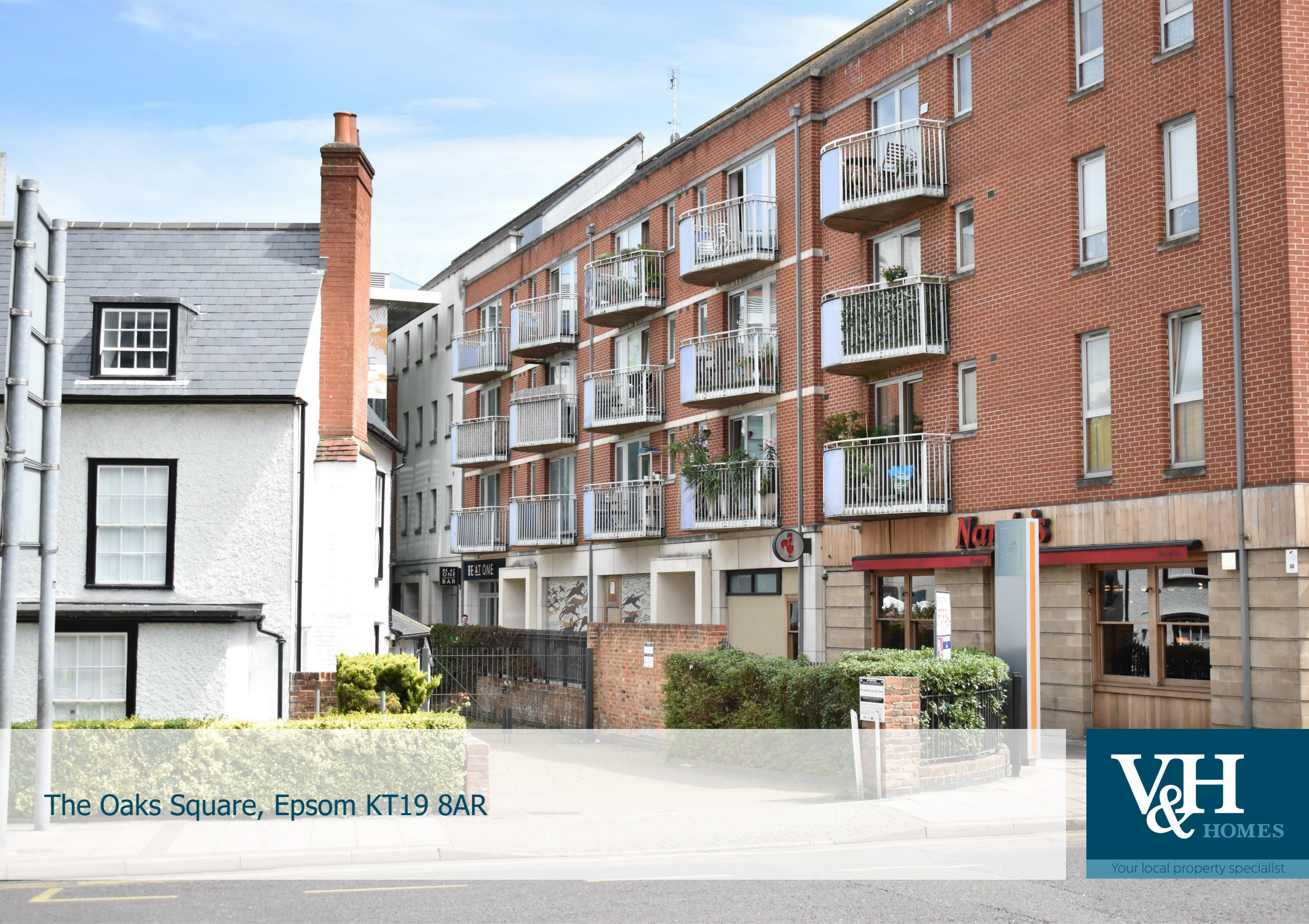
The Oaks Square, Epsom KT19 8AR