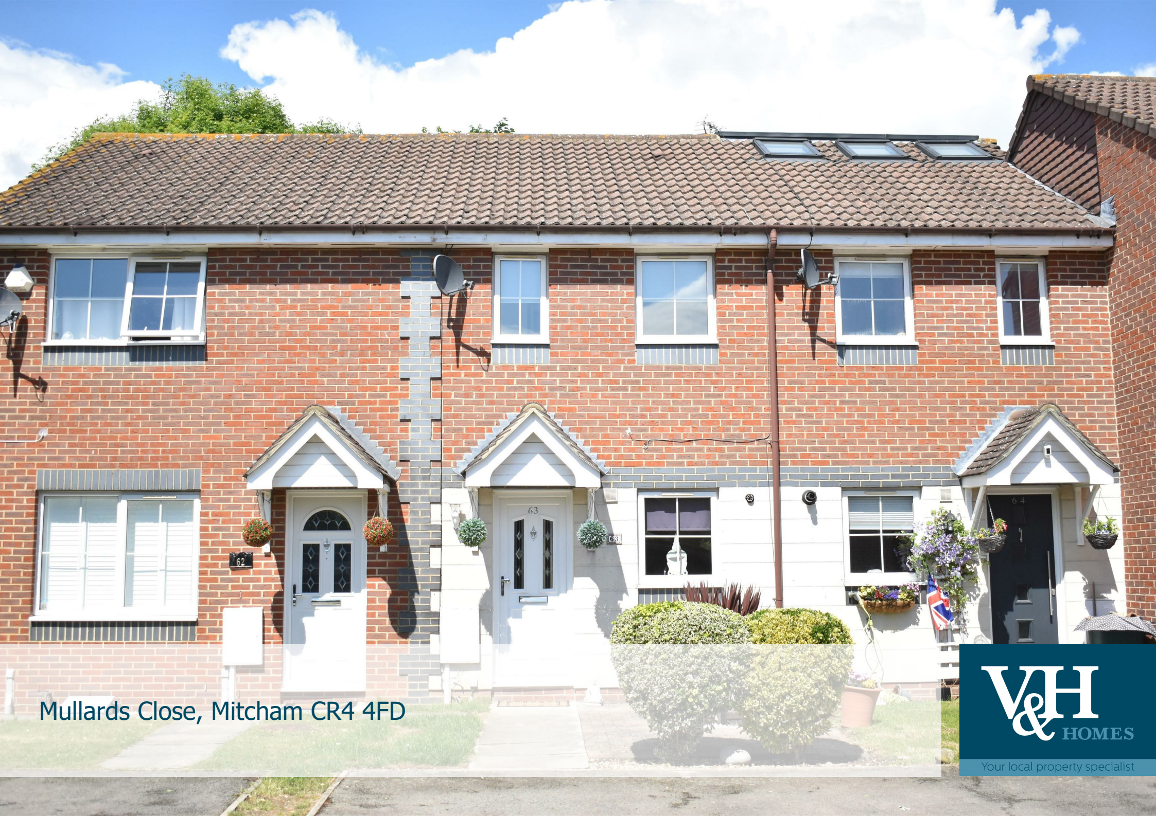
Mullards Close, Mitcham CR4 4FD