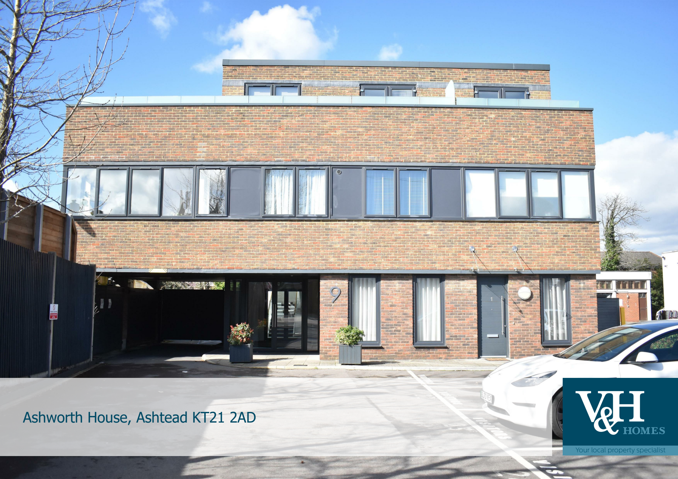
Ashworth House, Ashted KT21 2AD