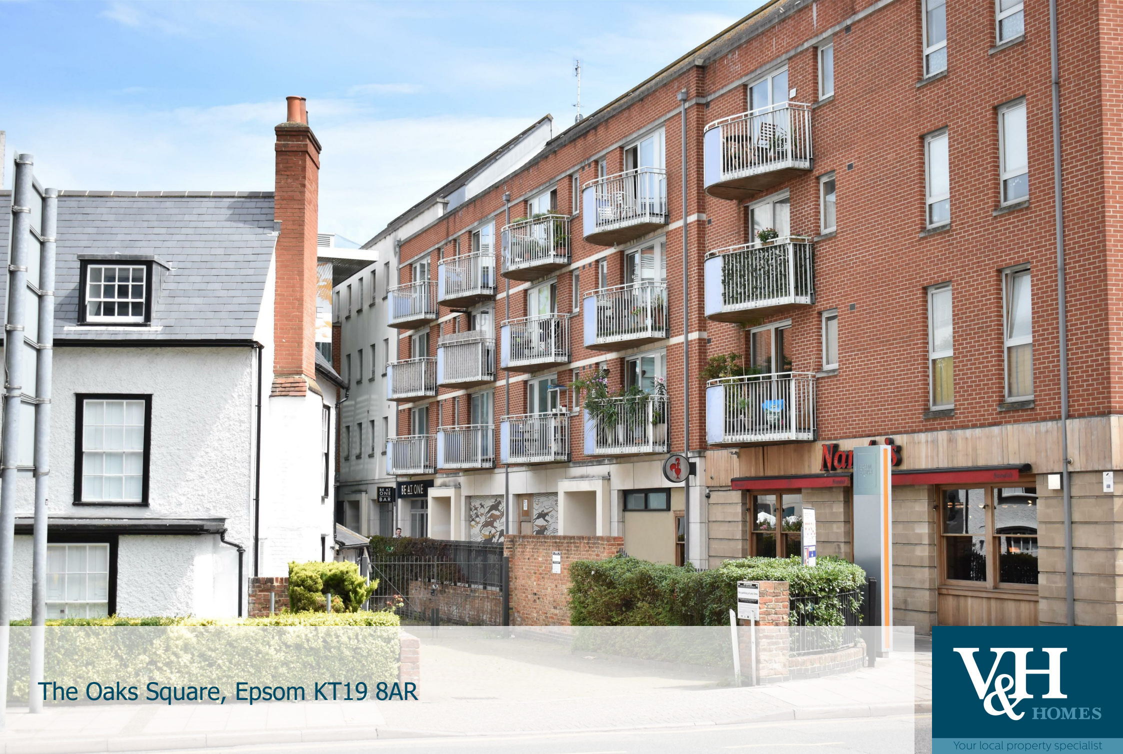
The Oaks Square, Epsom KT19 8AR