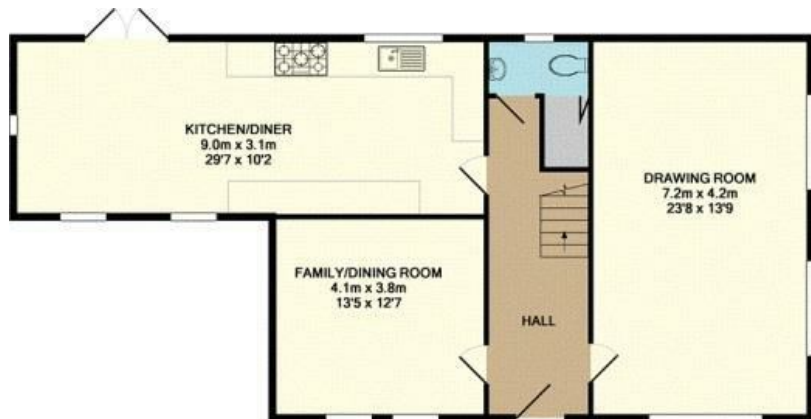
GROUND FLOOR APPROX. FLOOR AREA 91.0 SQ.M. (979 SQ.FT.)