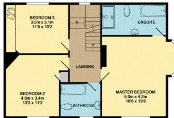
1ST FLOOR APPROX. FLOOR AREA 73.9 SQ.M. (795 SQ.FT.)