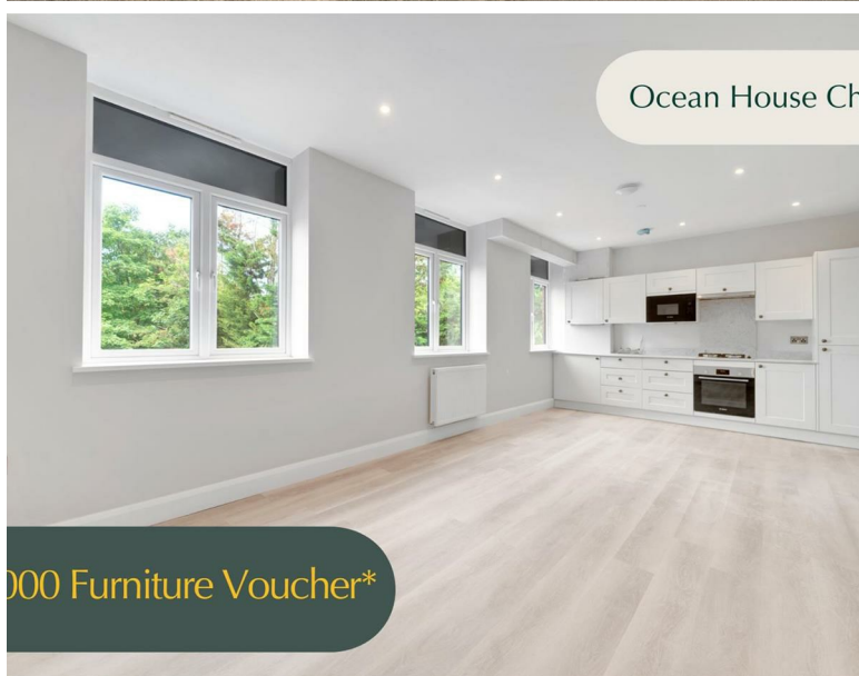
Ocean House Ch