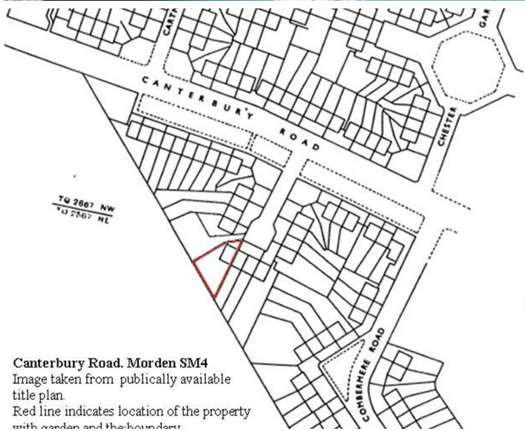
Canterbury Road, Morden SM4 Image taken from publicly available title plan. Red line indicates location of the property with garden and the boundary