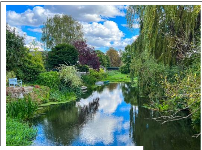
Easy reach of The Wilderness with bridges over the River Mole leading to a children's playground and recreational fields – (Ideal for an afternoon stroll or dog walking)