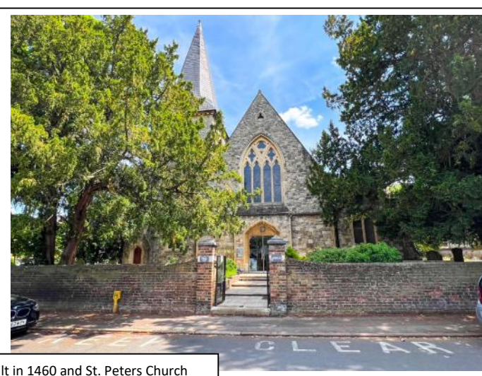
Easy reach of the historical Bell Pub built in 1460 and St. Peters Church along with local children's nurseries and primary schools