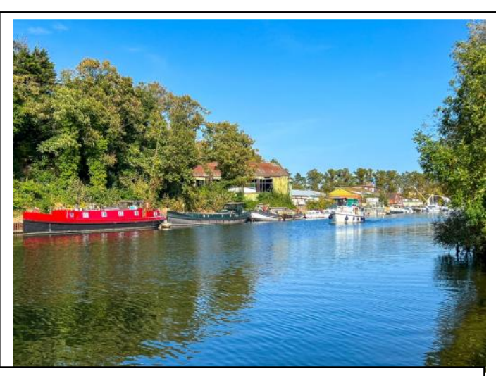
The property is within easy reach of Hurst Park and very close to Hurst Park Meadows (Ideal for walking) with wonderful views St. Mary's Church in Hampton. The River Thames towpath leads up to Hampton Court with its Palace, restaurants, cafes, bars and train station – Ideal for commuter into London, Waterloo – Zone 6, Oyster Card