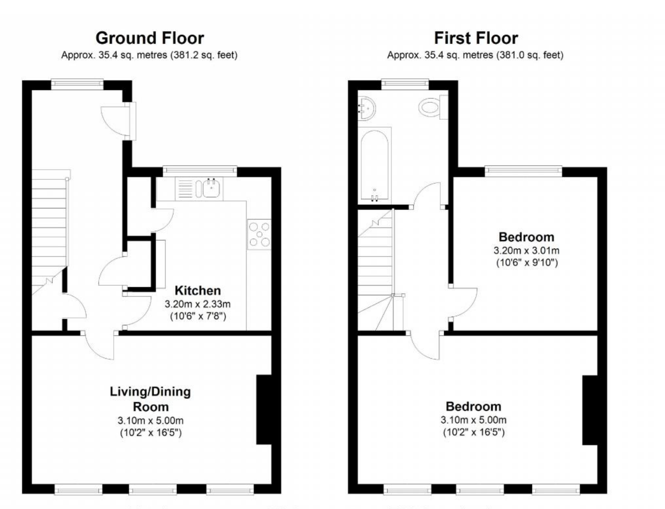
Total area: approx. 70.8 sq. metres (762.2 sq. feet)