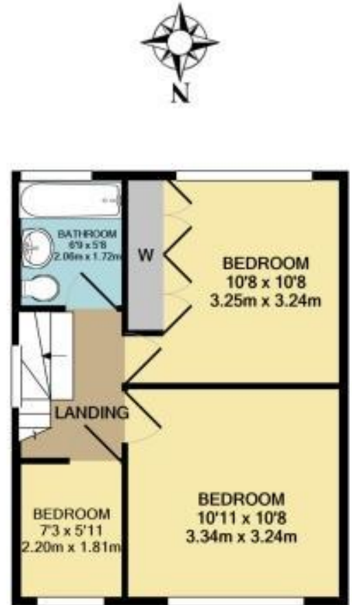
1ST FLOOR APPROX. FLOOR AREA 360 SQ.FT. (33.5 SQ.M.)

TOTAL APPROX. FLOOR AREA 1117 SQ.FT. (103.8 SQ.M.)