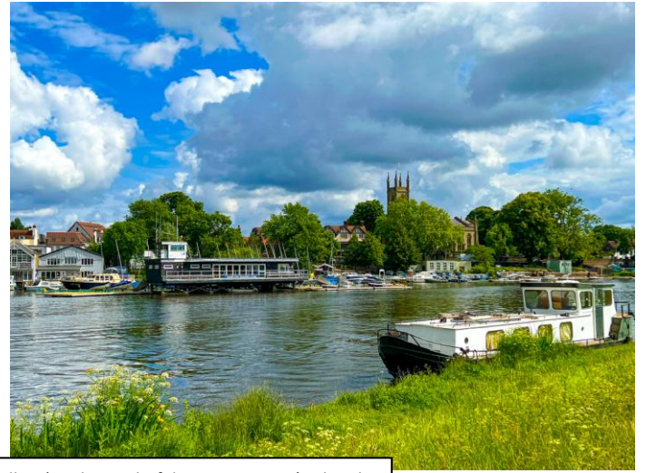
A selection of photographs of Hurst Park (Ideal for walking) with wonderful views St. Mary's Church in Hampton with footpath leading up to Hampton Court Place + train station and Walton on Thames