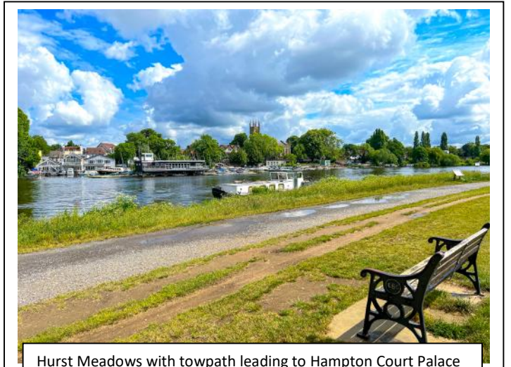
Hurst Meadows with towpath leading to Hampton Court Palace