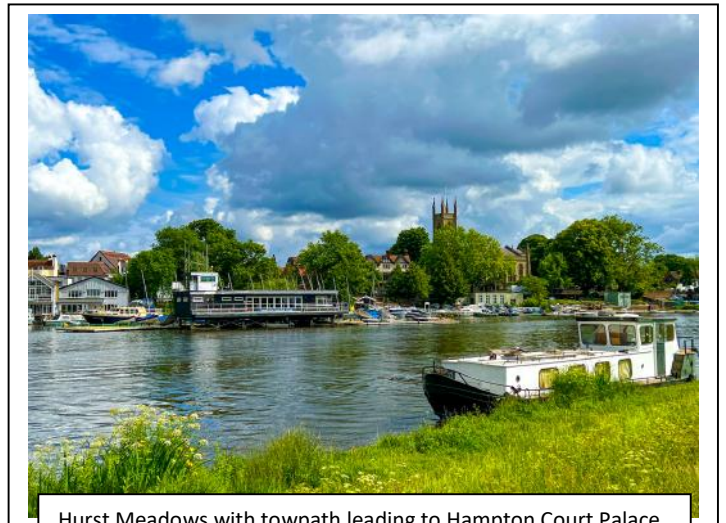
Hurst Meadows with towpath leading to Hampton Court Palace