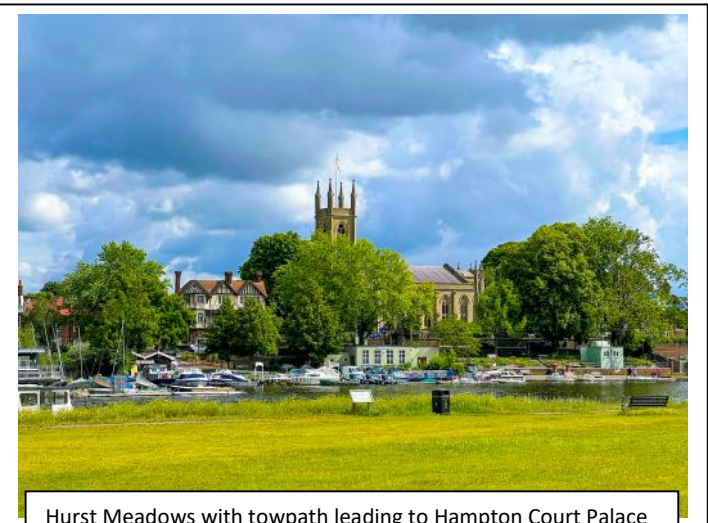
Hurst Meadows with towpath leading to Hampton Court Palace