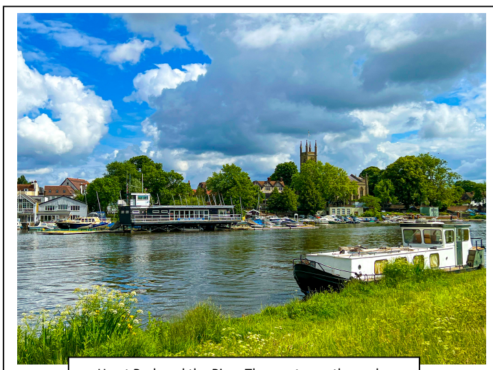
Hurst Park and the River Thames towpath nearby