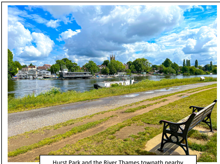
Hurst Park and the River Thames towpath nearby