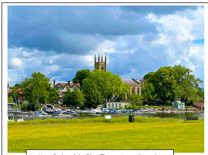
Hurst Park and the River Thames towpath nearby