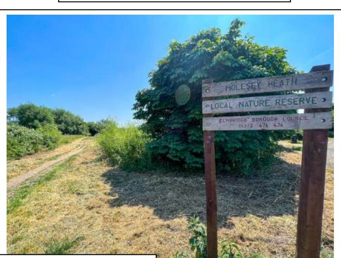
Easy reach of Molesey Heath with local nature reserve leading to the River Mole and The Wilderness/Neilsons Park - Ideal area for dog walking