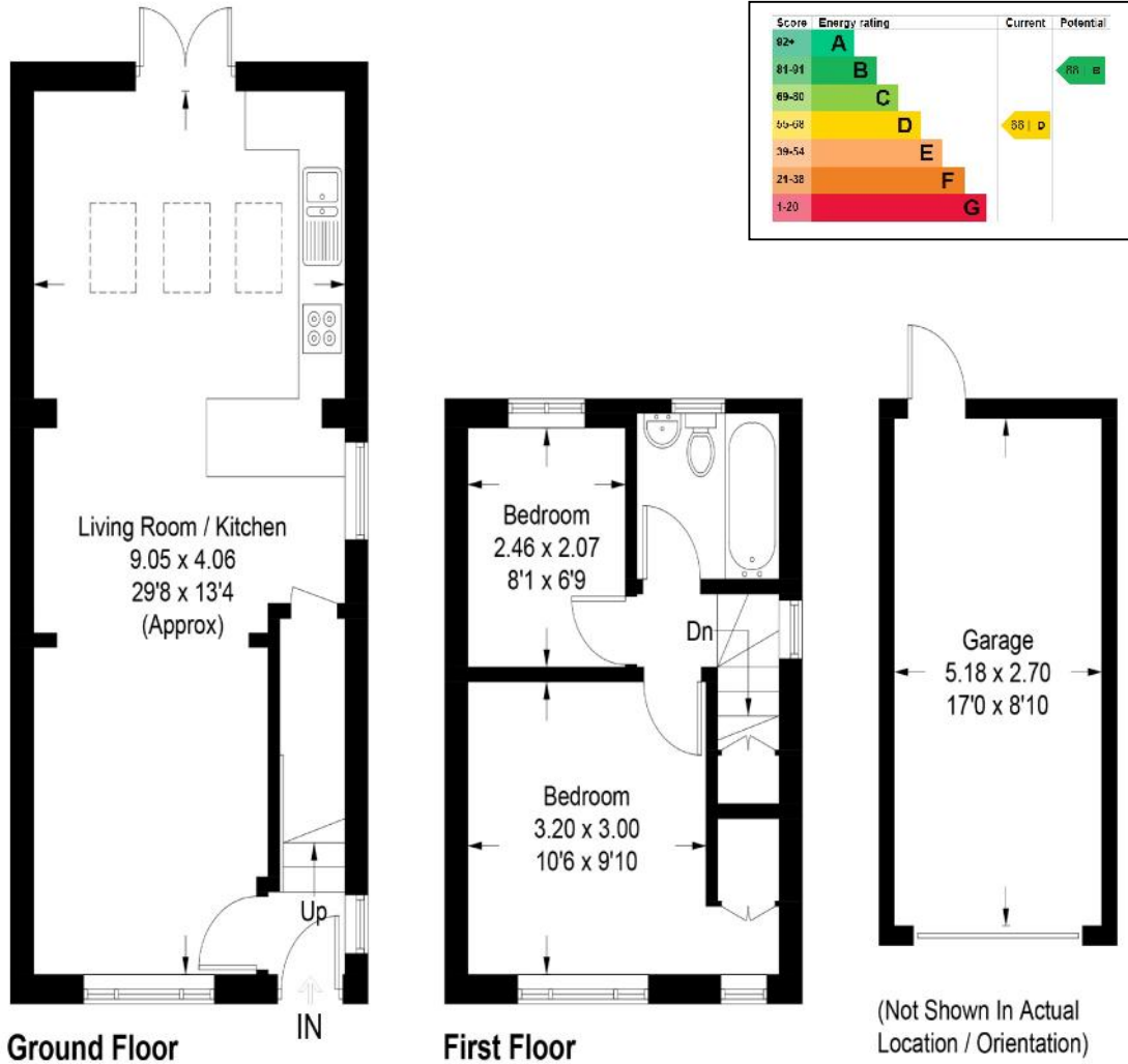
Illustration for identification purposes only, measurements are approximate, not to scale. floorplansUsketch.com © (ID733032)

Approximate Gross Internal Area = 59.9 sq m / 645 sq ft Garage = 14.0 sq m / 151 sq ft Total = 73.9 sq m / 796 sq ft