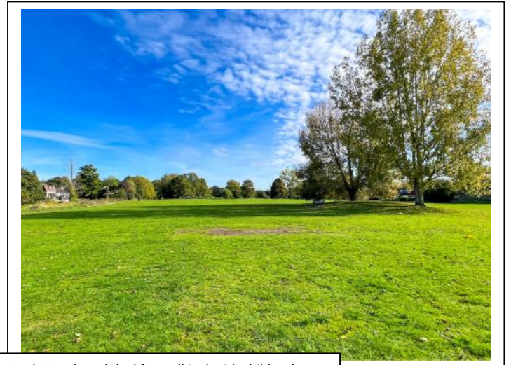
A selection of photos - The property backs onto Hurst Park Meadows (Ideal for walking) with children's playground and wonderful views St. Mary's Church in Hampton