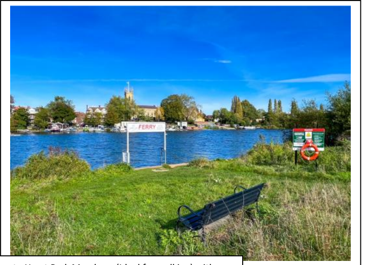
A selection of continued photos - The property backs onto Hurst Park Meadows (Ideal for walking) with children's playground and wonderful views St. Mary's Church in Hampton