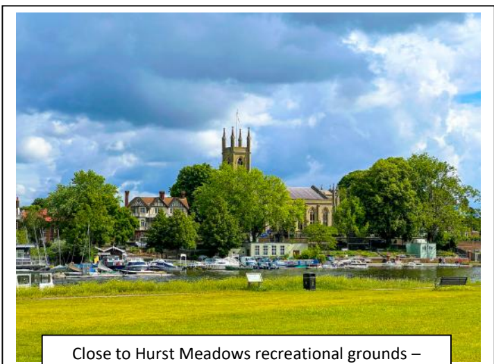
Close to Hurst Meadows recreational grounds – Ideal for walks up to Hampton Court