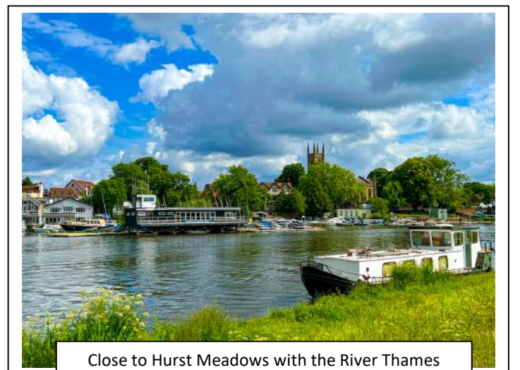
Close to Hurst Meadows with the River Thames towpath