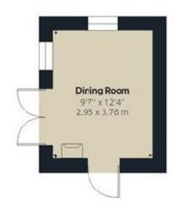
Floor O Building 2