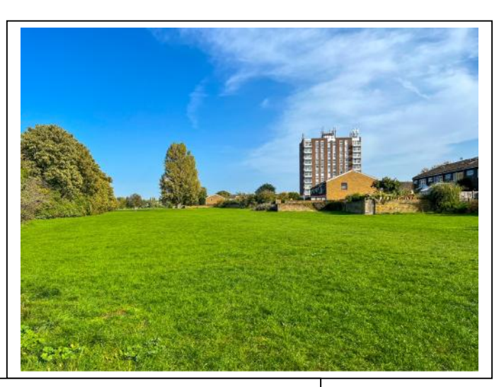
Easy reach of Hurst Park with the River Thames and towpath leading up to Hurst Meadows recreational grounds (Ideal for dog walking) and upto Hampton Court with its Palace and train station