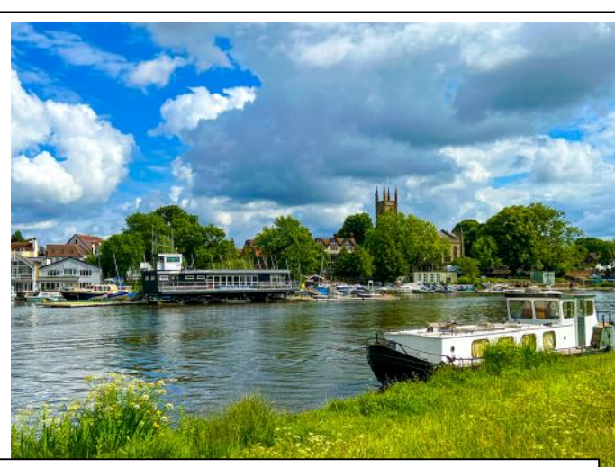
The property is within the Hurst Park development and very close to Hurst Park Meadows (Ideal for walking) with wonderful views St. Mary's Church in Hampton. The River Thames towpath leads up to Hampton Court with its Palace, restaurants, cafes, bars and train station – Ideal for commuter into London, Waterloo – Zone 6, Oyster Card