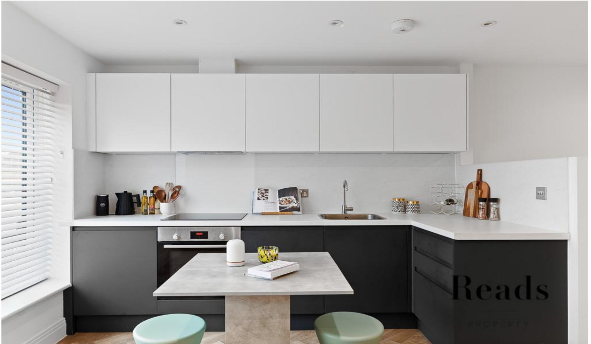
Fountain House, Cleeve Road, Leatherhead