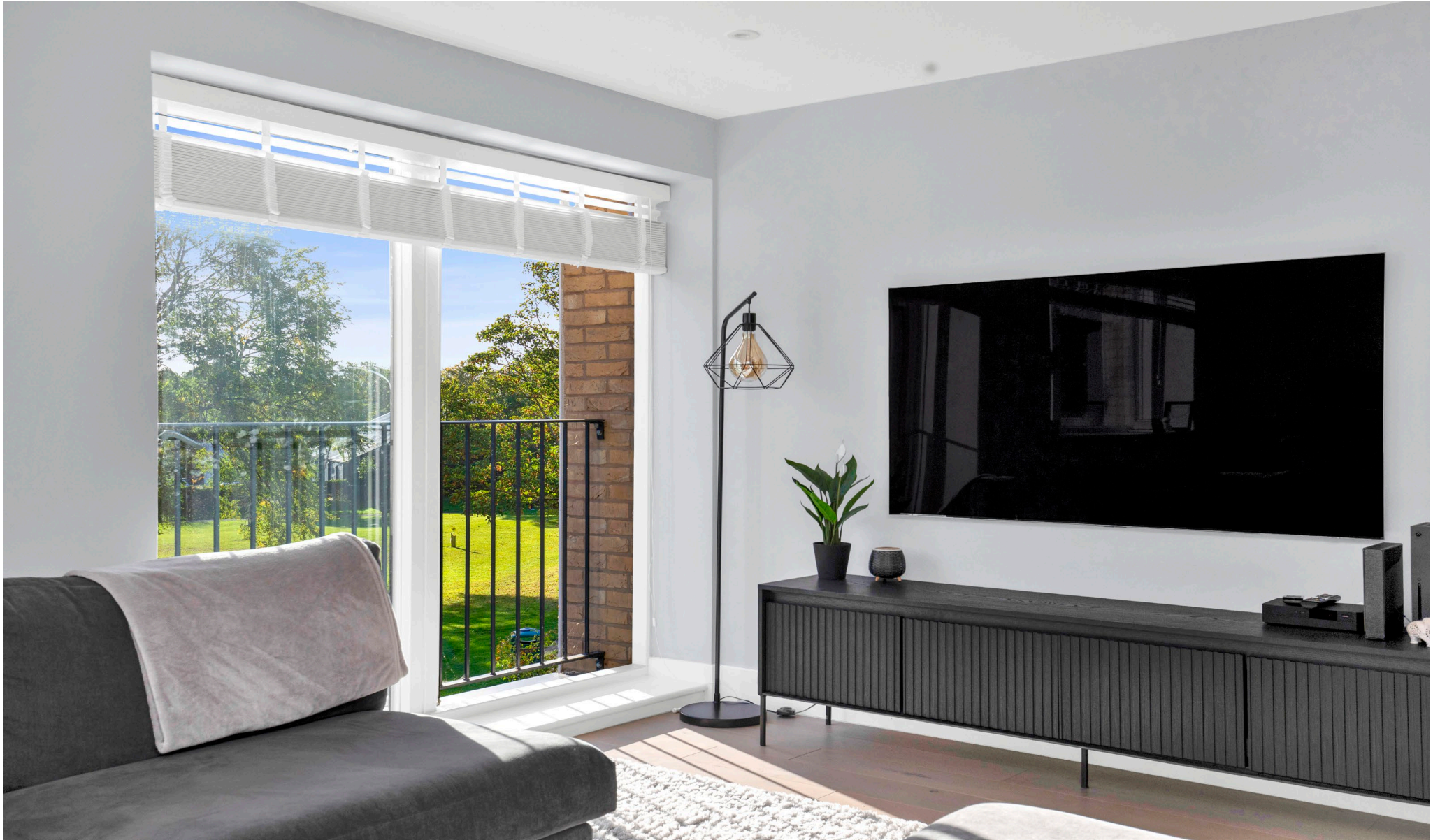
7 Oaks View, Court Lane, Epsom