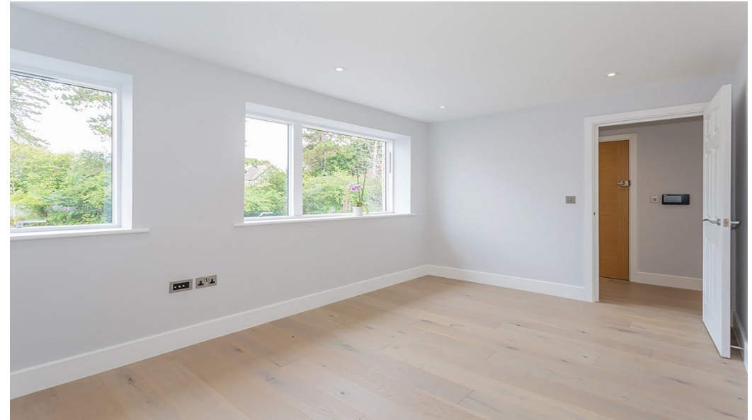
7 Oaks View, Court Lane, Epsom