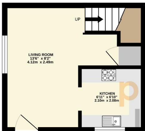
GROUND FLOOR 204 sq.ft. (18.9 sq.m.) approx.