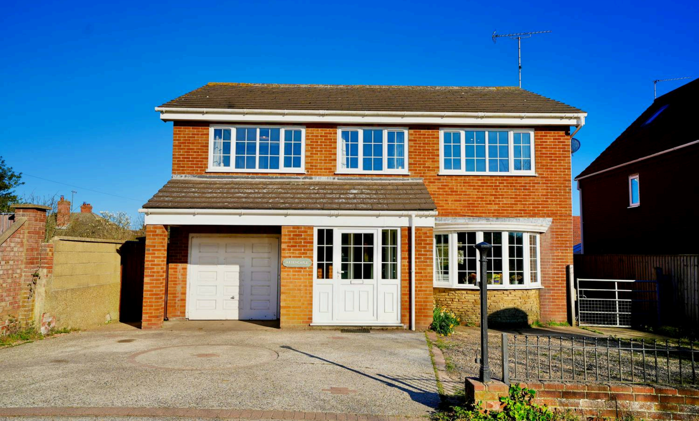
Ardencaple Church Lane, Mundesley £400,000