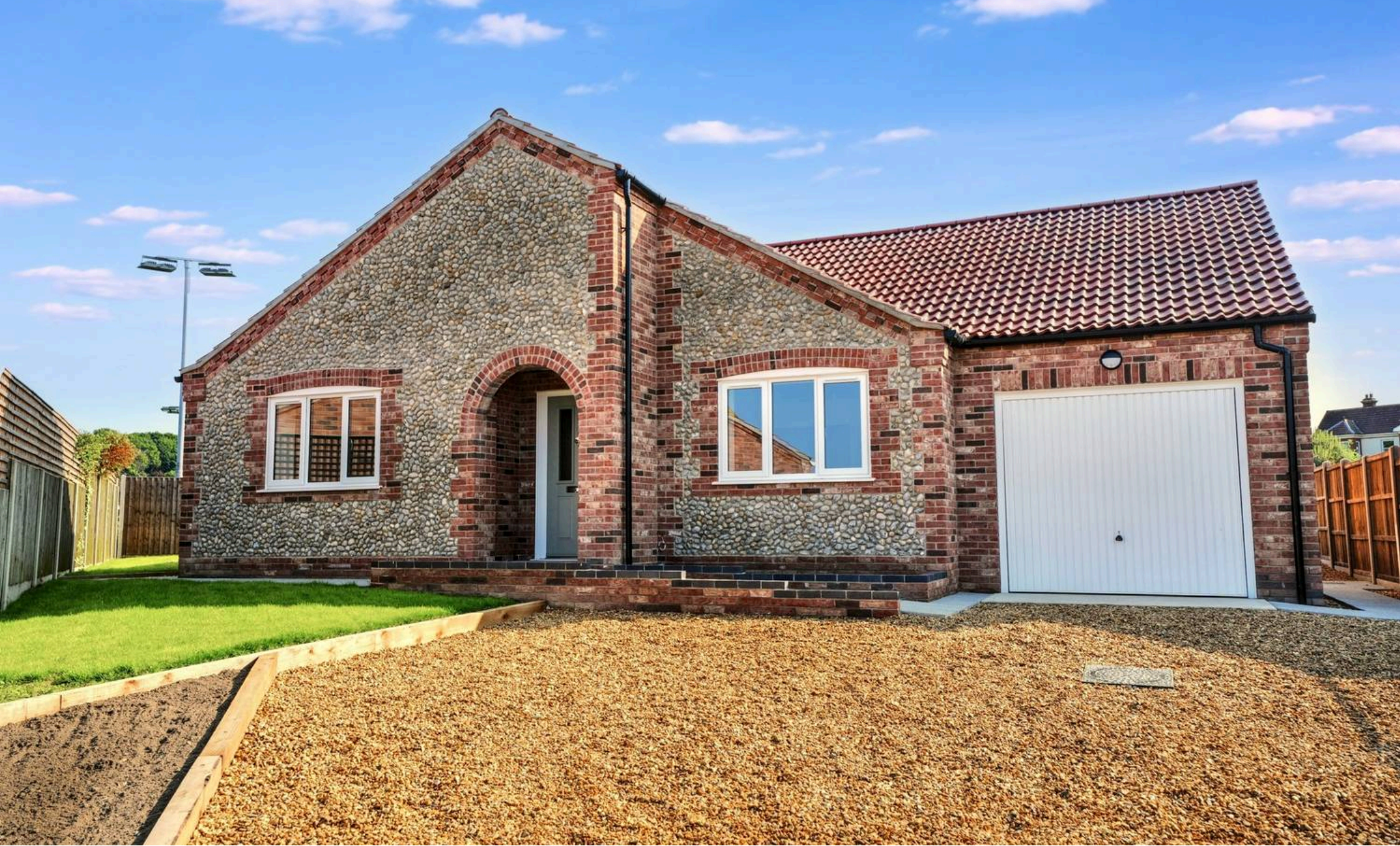
New Build, Cromwell Close, Cromer £625,000