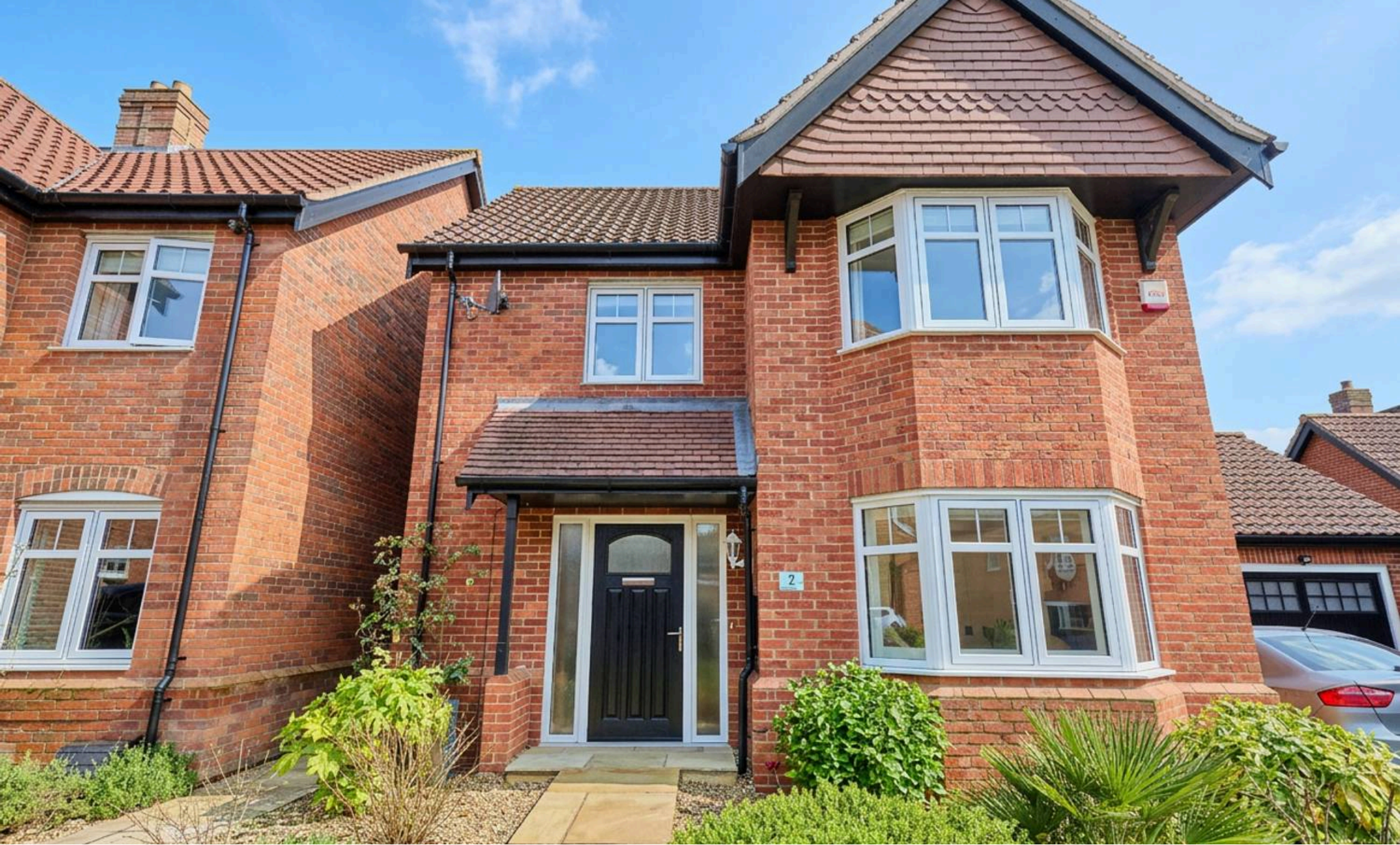
2 Vaughan Close, Cromer £475,000