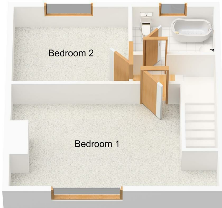
First Floor Approx. 28.20 sqm. (303.00 sqft.)