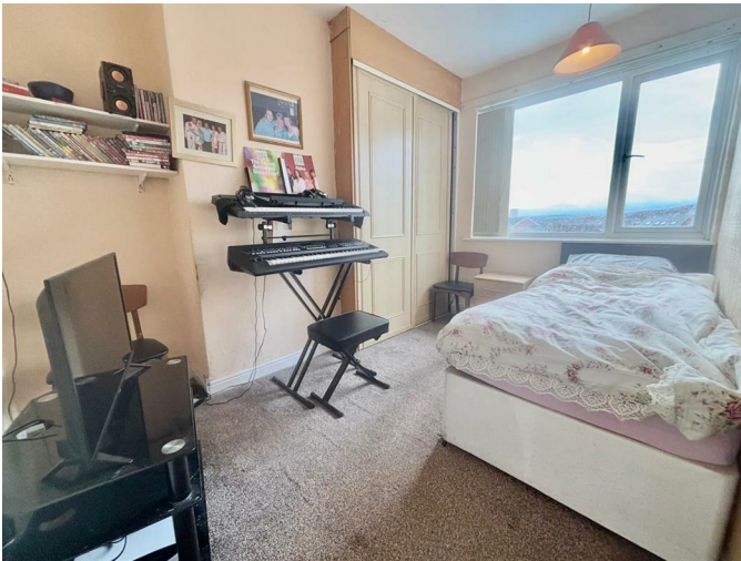
Double glazed window, central, built in wardrobes. heating radiator