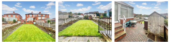
The property benefits from having gardens to the front and rear. To the front the garden is low maintenance with a lawn & planted beds. The rear garden has a good size lawn, a paved patio, two sheds & one greenhouse.