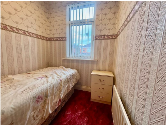
Double glazed window, central heating radiator