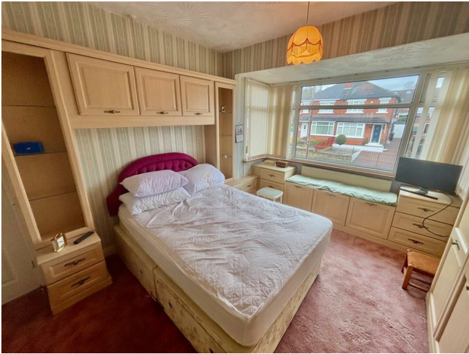
Double glazed window, built in wardrobes and draws including bed side tables, central heating radiator