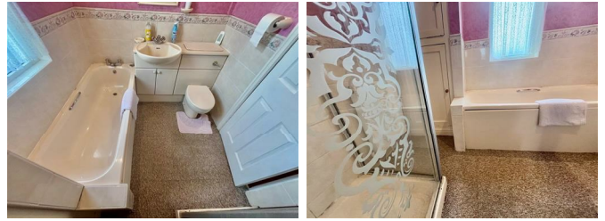
Double glazed window, a four piece suite comprising of a panelled bath with mixer taps, a separate shower cubicle with Mira shower, Wash basin set into a vanity unit, low flush WC, central heating radiator