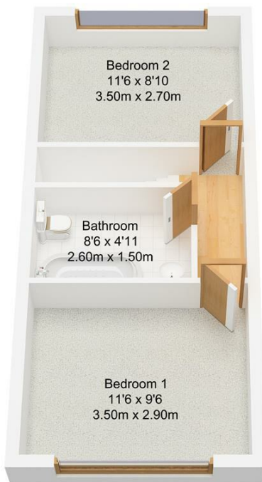
First Floor Approx. 29.05 sqm. (312.69 sqft.)