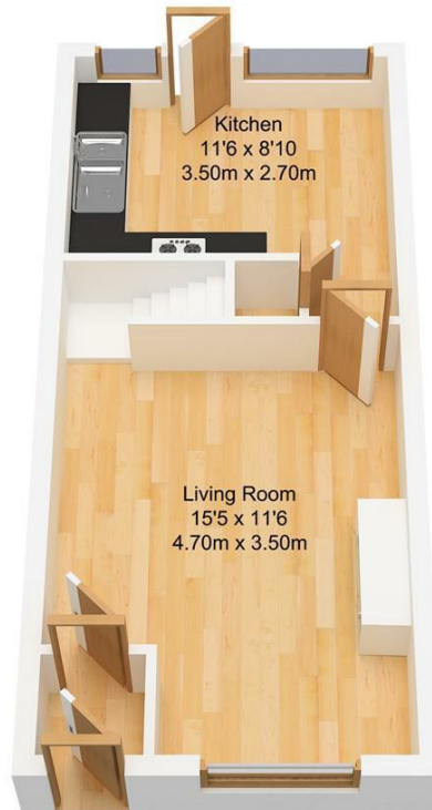
Ground Floor Approx. 29.05 sqm. (312.69 sqft.)