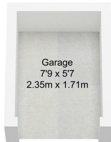
Garage Approx. 4.03 sqm. (43.37 sqft.)