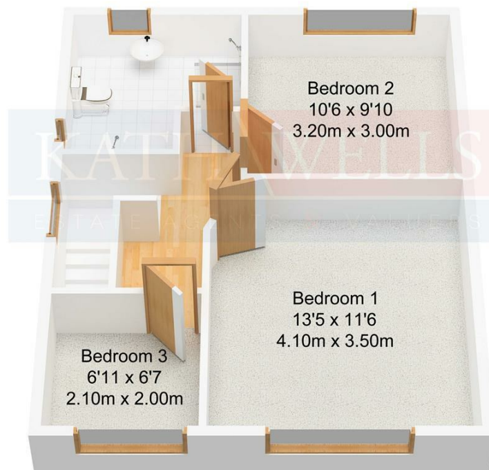
First Floor Approx. 39.40 sqm. (424.00 sqft.)