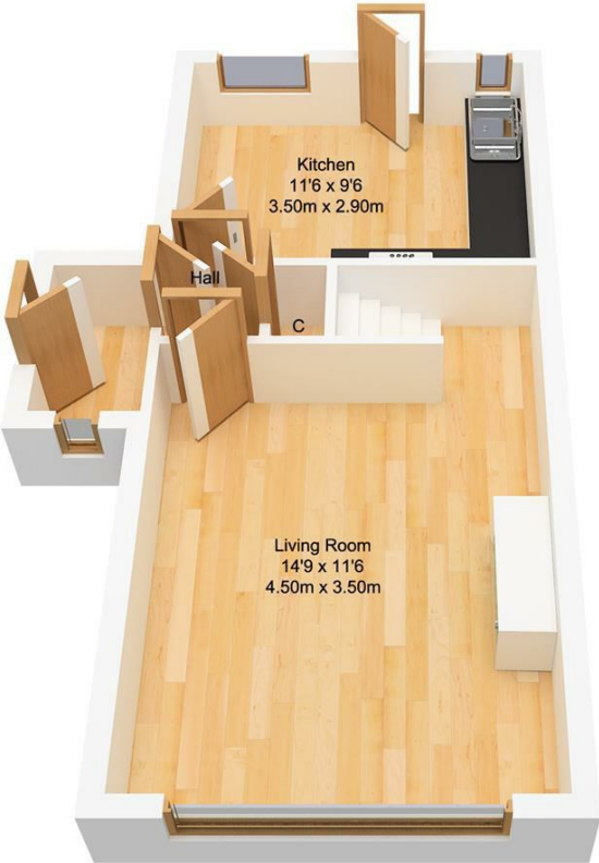
Ground Floor Approx. 31.72 sqm. (341.43 sqft.)