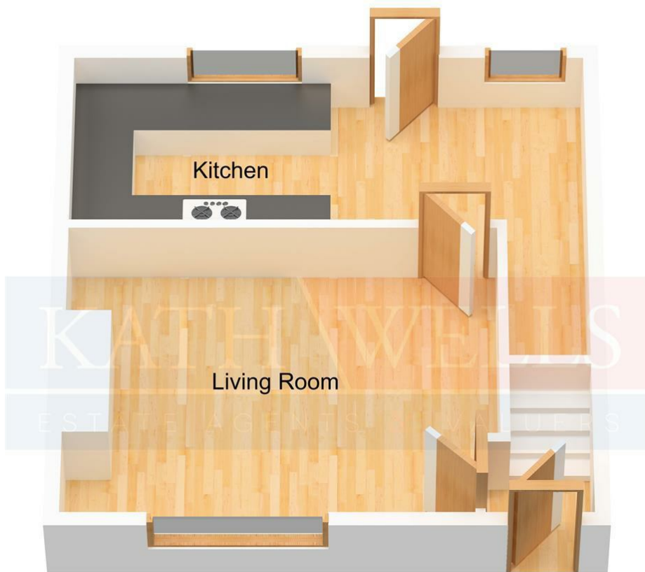
Ground Floor Approx. 27.90 sqm. (301.00 sqft.)