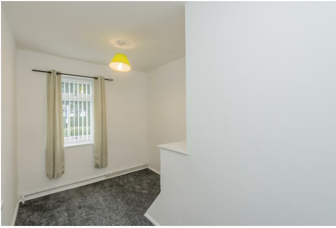
Double glazed window, central heating radiator