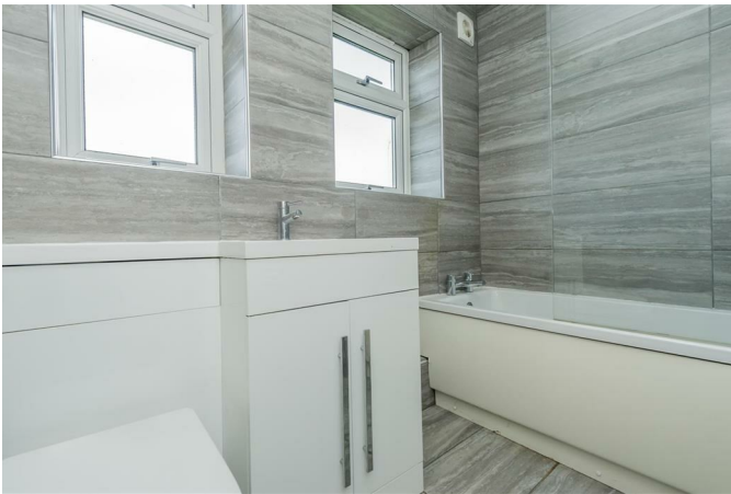
Two double glazed windows, a modern recently fitted white suite comprising of a panelled bath with a glazed side screen and a plumbed shower, wash basin set into a vanity unit, low flush WC, ladder style central heating radiator / towel warmer