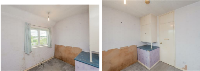
Double glazed window, storage cupboard