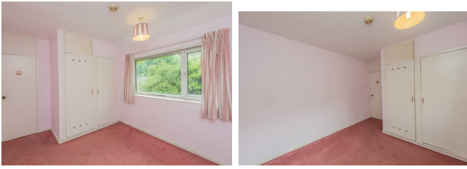
Double glazed window, storage cupboard