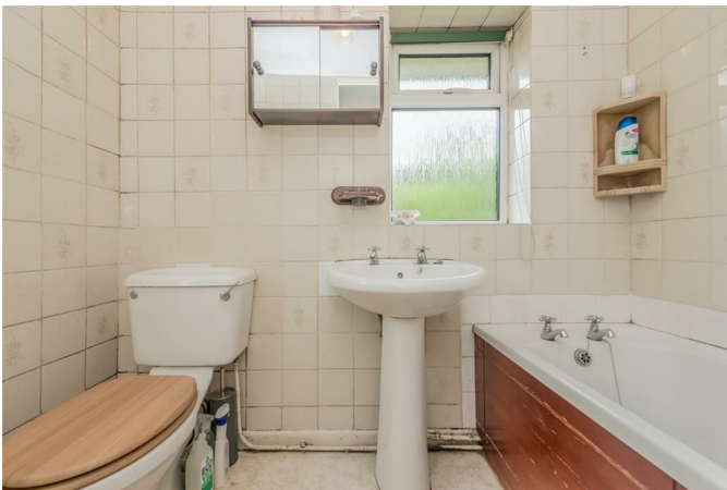
Two double glazed windows, a white suite comprising of a panelled bath with an electric shower above, wash basin, low flush WC