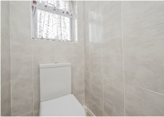
Double glazed window, low flush WC