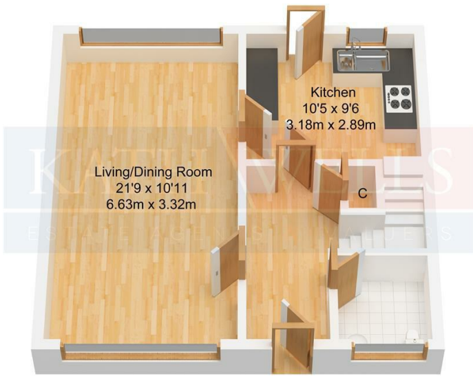
Ground Floor Approx. 44.15 sqm. (475.22 sqft.)