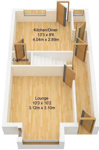
Ground Floor Approx. 29.43 sqm. (316.78 sqft.)