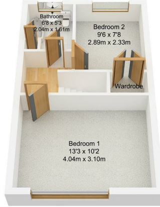
First Floor Approx. 28.20 sqm. (303.54 sqft.)