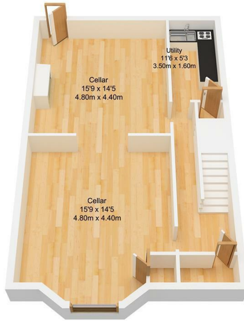
Lower Ground Floor Approx. 60.29 sqm. (648.95 sqft.)