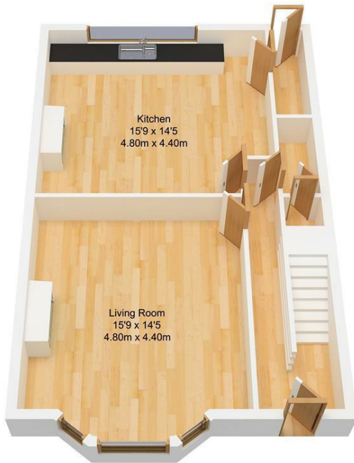
Ground Floor Approx. 60.29 sqm. (648.95 sqft.)