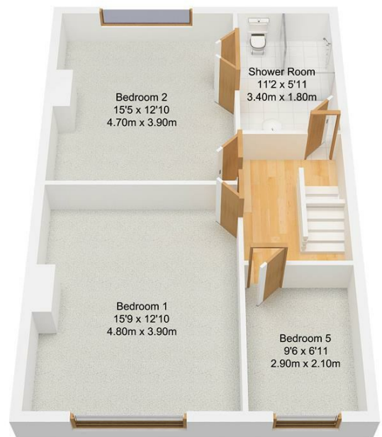
First Floor Approx. 59.17 sqm. (636.90 sqft.)