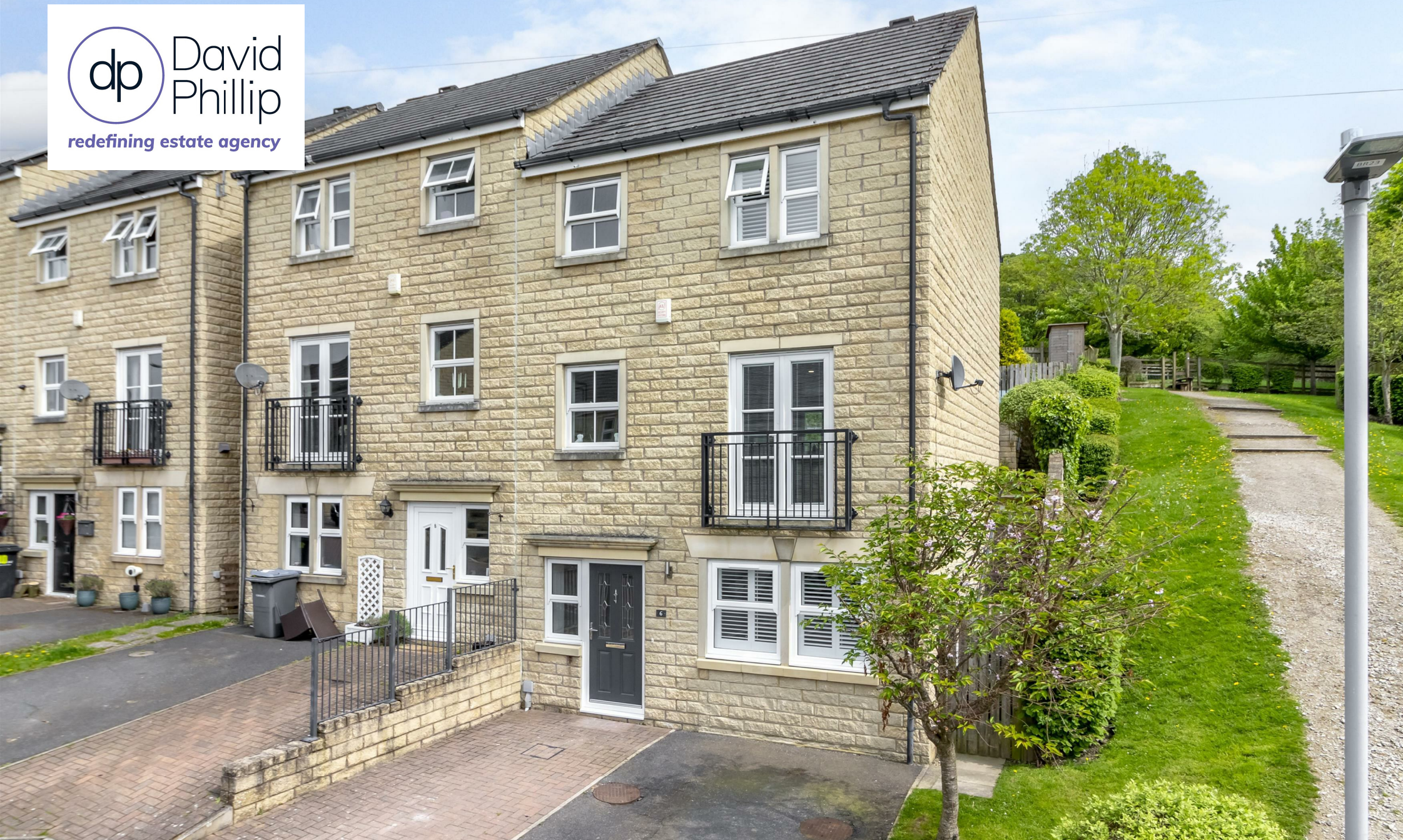
6 Herdwick View, Keighley, BD20 5EN £325,000