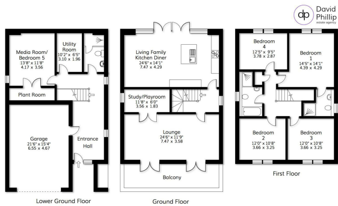
Approx Gross Floor Area = 2183 Sq. Feet (Excluding Garage) = 202.36 Sq. Metres For illustrative purposes only. Not to scale.

Agents Note – A member of staff at David Phillip Estate Agents is related to one of the Directors of the Company developing this site.